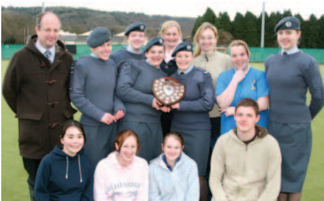
Winners – Surrey's talented hockey team