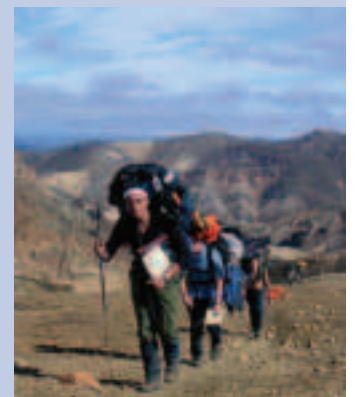
Traversing difficult Icelandic terrain

The teams had a very difficult crossing of an icefield, which had been in part, covered in volcanic ash from an eruption the previous year. Under the icefield a huge ice-cave had been formed by hot water coming up out of the ground and the cadets were able to get inside to take measurements.