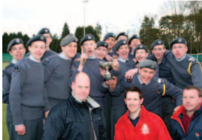
Kent Soccer Team –LASER Winners

Elsewhere, the region's senior girls brought daring skill and aggression to the competition played out on the Astro turf