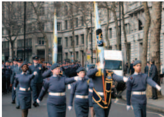
LASER Region Banner Party