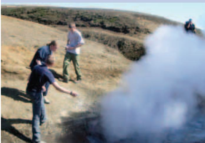
Icelandic geothermal observations by Essex cadets

Thirty members of Essex Wing travelled to Iceland to carry out their Gold Duke of Edinburgh Award Expedition. The expedition, which was Essex Wing's ninth major