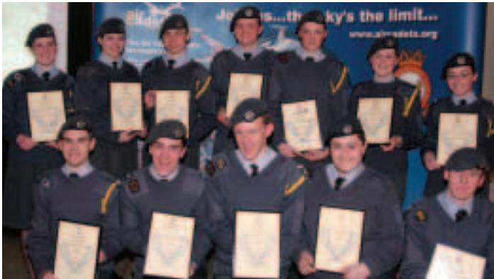
Essex Wing's High Achievers

The magnificent 200 year old Shire Hall, in Chelmsford town centre, was the setting for Essex Wings Awards Night attended by over 400 young people, parents and staff on Friday 3rd March