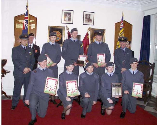
Staff and Cadets of the successful squadrons representing the Wing in the annual Lord Lieutenant's Poppy Appeal Competition - see report on p. 3