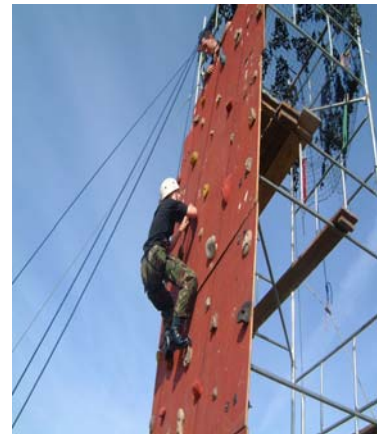
A Cadet scaling the climbing wall