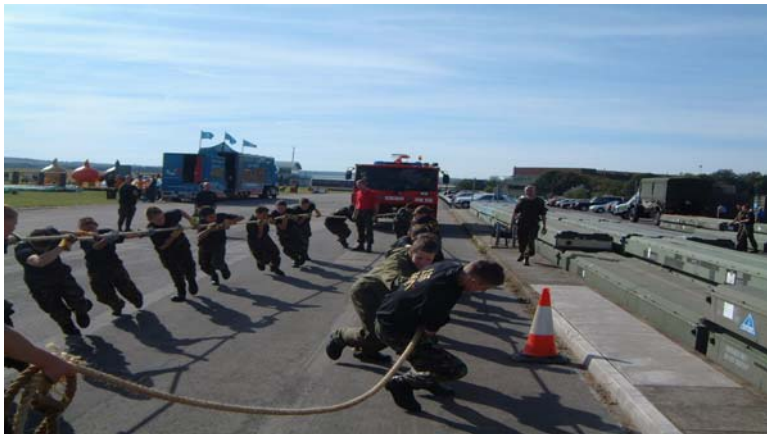
Cadets of 135 (Reigate & Redhill) Squadron pulling Odiham's Fire Engine.