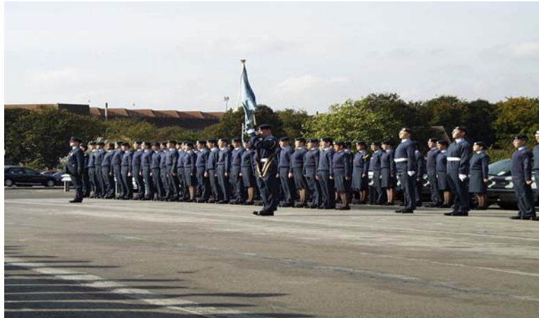
Wing Guard of Honour drawn up and awaiting Commandant Air Cadets inspection.