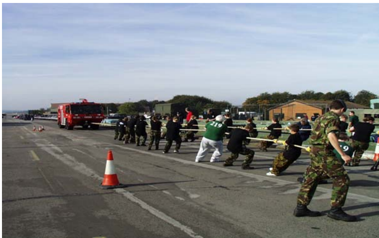
Competitors in the Fire Engine Pull Competition take the strain.