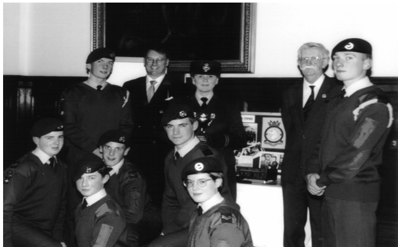
Cadets & Staff of 323 (Epsom & Ewell) Sqn with their display at County Hall