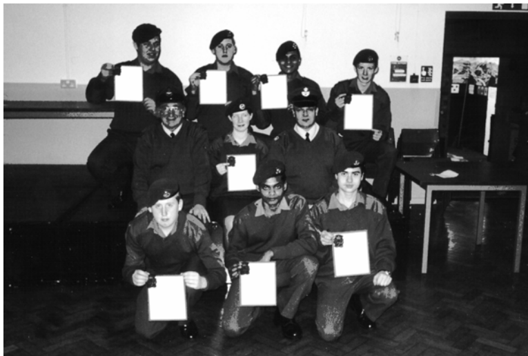
The eight Cadets of 18F with their Bronze D of E Award Certificates and Badges